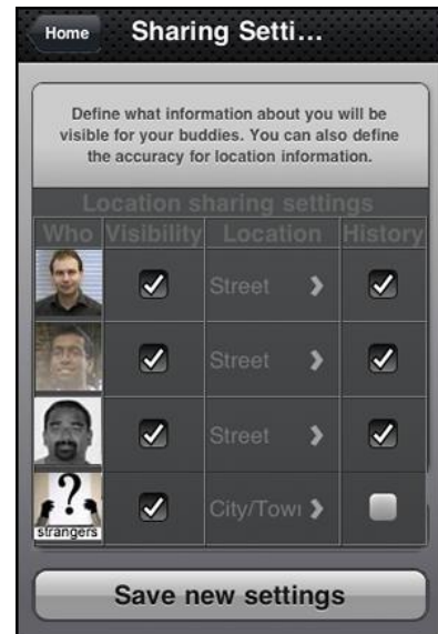
Figure 9. BuddyTracker selective disclosure features

location, the city she is in, the country she is in, or reveal nothing at all (invisible). This last feature provides the selective disclosure capabilities we are focussing on in this paper (Figure 4). The BuddyTracker server also integrates a machine learning system that can automatically infer constraints on these privacy settings based on user behaviour [15]. These learned constraints can be used to specify the warrants of the privacy arguments.